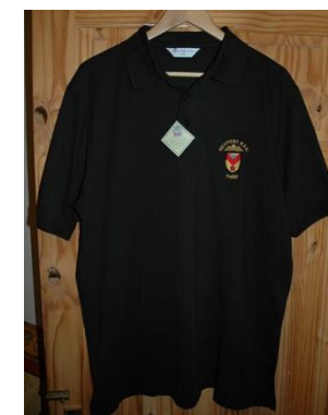
Standard Polo £13.50

Other goods & colours available, visit the FoNR table, these items are not available in the club shop!