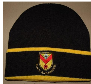
Beanie Hats £5