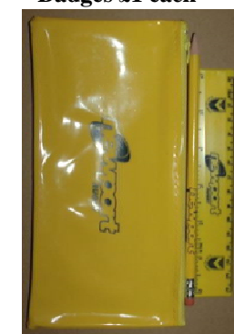
Pencil Set £1.00