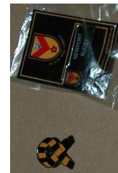
Badges £1 each