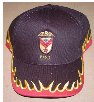
“Flames” cap £9