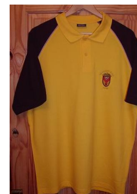
Contrast Polo £15