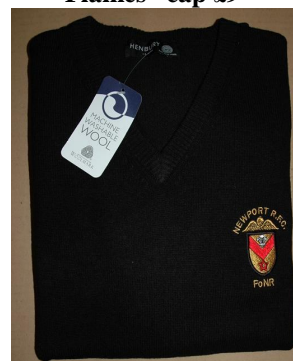
Lambswool Jumpers £35